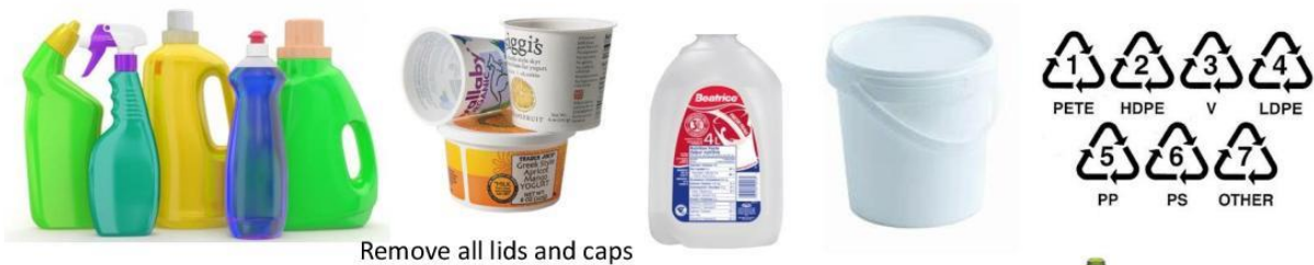
Remove all lids and caps