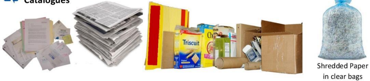
Shredded Paper in clear bags